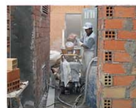
3. Easy to work in narrow spaces