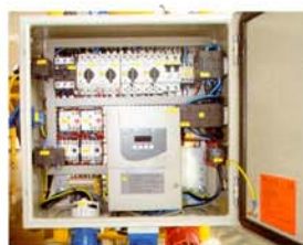
2. Electric control box. EU NORM 73/23 EU