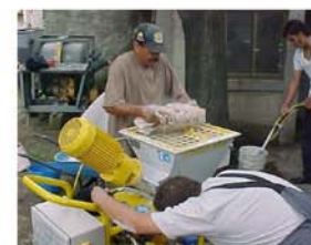
6. Convenient height for loading