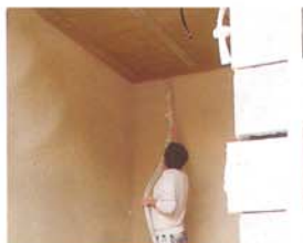
4. Plastering application