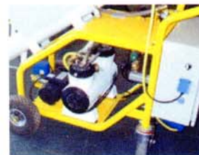
5. Air compressor 170l/min